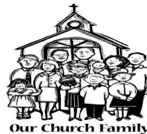
Our Church Family

Today is the day. We have been collecting soup for West Davidson Food Pantry for the last month with a goal of 600 cans. We have surpassed this total with 973 as of 2/6/24 cans being collected. Thanks to everyone who contributed to this.